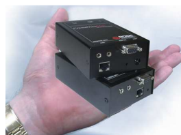
Small in size, loaded with features

The Serial/Audio model allows stereo audio to be transmitted in either direction across the CAT5 link simultaneously. Many serial devices like a Touchscreen can plug directly into the serial port on the Remote Unit. The Mini model is small in size but loaded with state of the art technology. It is ideal for extending the distance between a CPU and a KVM station (up to 150 feet).