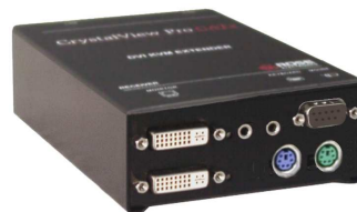
CrystalView DVI CATx (PS/2 model)