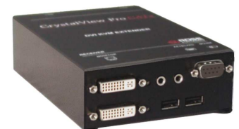
CrystalView DVI CATx (USB model)