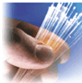
Fiber makes extended distances easy to reach

If your system requires dual video, the CrystalView DVI Plus dual video model can fully support it.