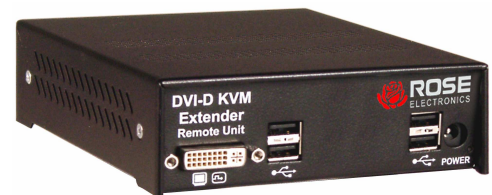
Rear View single / dual Link – single Video – USB 2.0