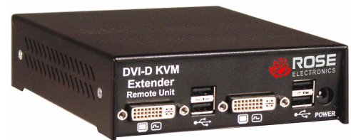
Rear View single Link – dual Video – USB 2.0

■ Phone: 281-933-7673 ■ E-mail: sales@rose.com ■