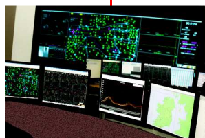
Extend quad video up to 33,000 feet over singlemode fiber cable

All models are available with both transmitter and receiver KVM access. The transmitter's KVM access allows an additional KVM station to be connected to the transmitter unit.