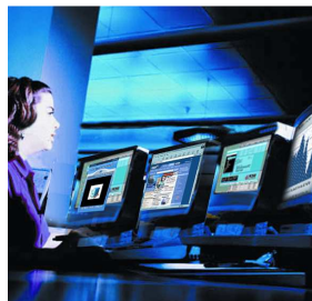
View single, dual, and quad video 1,000 feet away

The bi-directional serial option allows you to connect a touchscreen, digital tablet, serial printer or other supported serial device to the remote location. No set-up is needed; just connect the serial device to the serial port and it's ready to use.