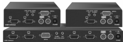
Rear view Remote units (Single / Dual / Quad)

■ Phone: 281-933-7673 ■ E-mail: sales@rose.com ■