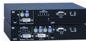
DUAL PC MODEL WITH AUDIO / SERIAL