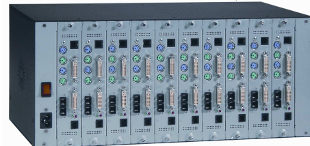
10 UNIT RACK

■ Phone: 281-933-7673 ■ E-mail: sales@rose.com ■