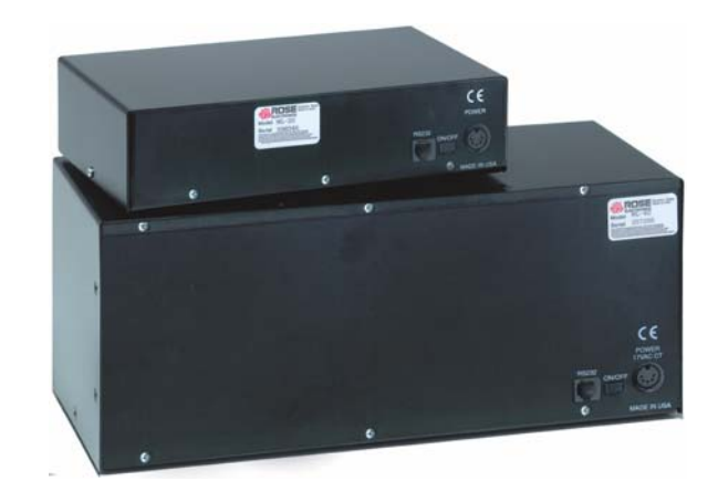
Rear view of MultiStation models ML-2U and ML-4U

■ Phone: 281-933-7673 ■ E-mail: sales@rose.com