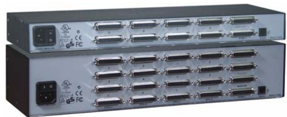
Rear View - MPB-4U2V (top) / MPC-4U4V (bottom)

■ Phone: 281-933-7673 ■ E-mail: sales@rose.com ■