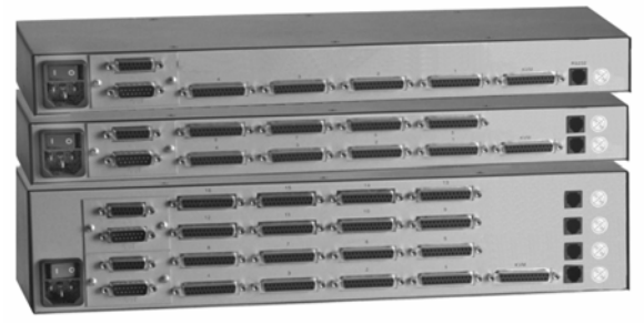
Rear view - UC1 1x4, 1x8, 1x16

■ Phone: 281-933-7673 ■ E-mail: sales@rose.com ■