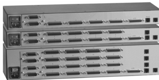
Rear view - UCR 1x4, 1x8, 1x16 (Shown with expansion cards)

■ Phone: 281-933-7673 ■ E-mail: sales@rose.com ■