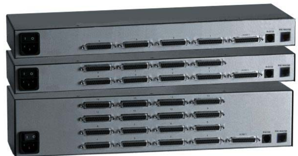
Rear view of UltraView remote