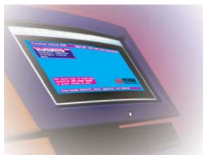
UltraView Remote on-screen menu

With its ability to access your computers and servers locally or over IP, its advanced on-screen menu system, built-in security, flash memory, easy expansion, and other features you start to get a sense of the advantages and applications that the UltraView Remote can provide..