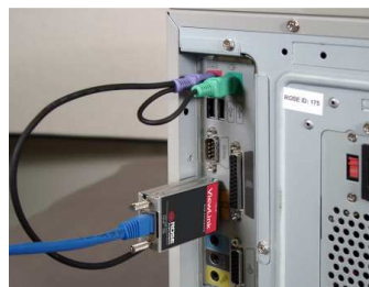
Connect the transmitter directly to a PC's Video, keyboard, and mouse ports